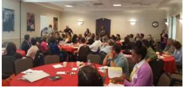
Central Valley Equity Symposium Equity: It Starts with Us April 21, 2017