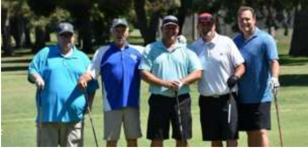
4th Annual Golf Tournament Thank you for golfing with us! Friday, June 2, 2017

Thank you for all those who have supported CLEAR this year. Click on the images below to see some of our past events.