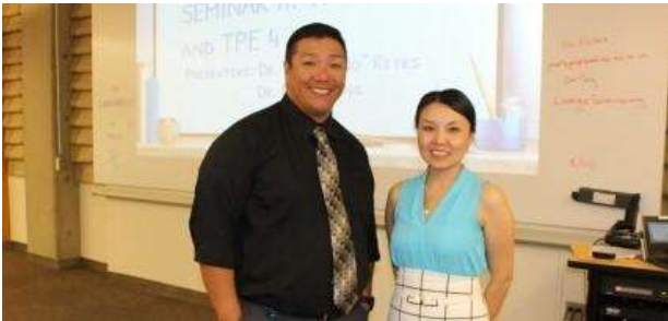
Professional Development Seminar Series Teacher Candidates Spring 2017